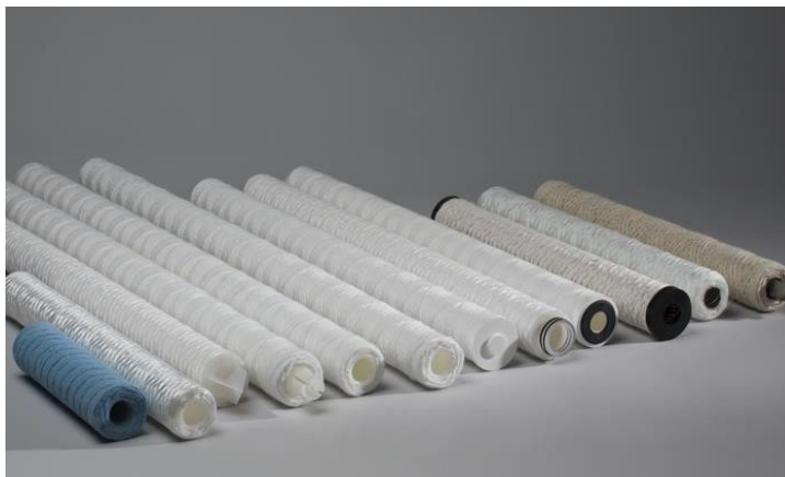
DW Series string wound filter cartridges are available in a variety of sizes and configurations.

The DW series string wound filters protect processes, people and the environment around the world. These depth filters offer a choice of filtration media, support cores, and materials to enable compatibility with most applications. End fitting options allow the retrofitting of most filter housings. Delta Pure Filtration can satisfy large orders with fast lead times. For potable water to aggressive chemicals, the DW series cartridges provide progressive depth filtration with high sediment-holding-capacity. Precision winding geometry provides consistent and controlled removal-efficiency.